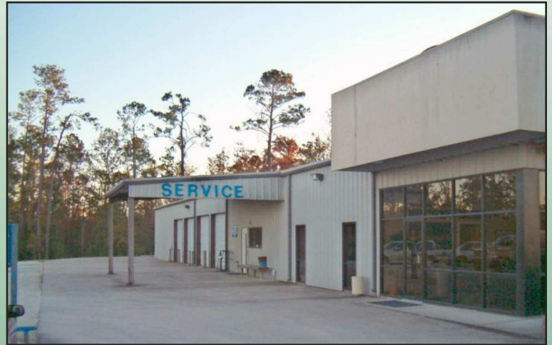
East Side Bldg