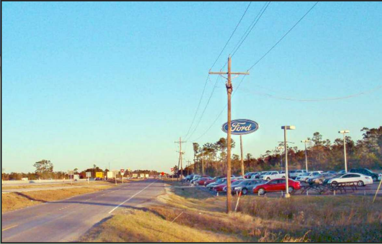
Property as seen from I 10 east service road

FOR SALE: FREEWAY INDUSTRIAL/COMMERCIAL 24518 Interstate 10E between FM 563 and SH 61, Chambers County, TX 77597